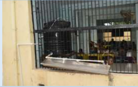
Fig. – 5 Drinking Facility