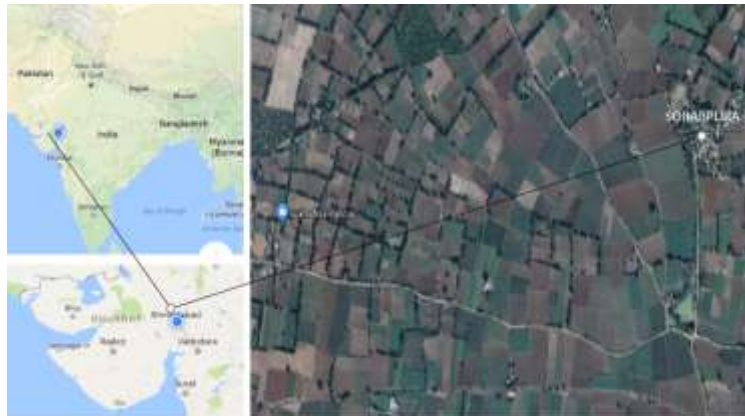
Fig- 1 location of sorabpura