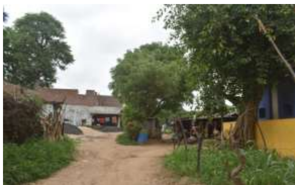
Fig- 8 Village roads of sorabpura