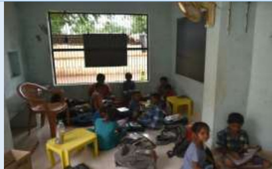
Fig. – 7 Classroom