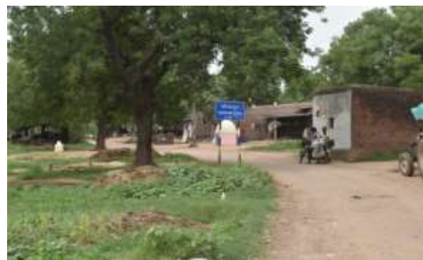
Fig- 9 Approach road towards sorabpura