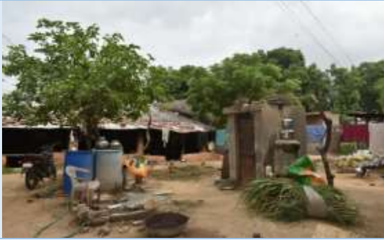
Fig. – 4 Sanitation Facility