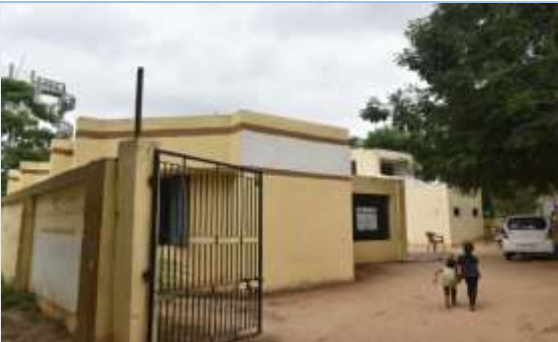
Fig. – 6 Primary School